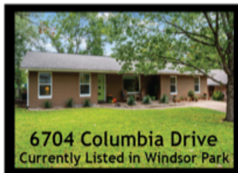
6704 Columbia Drive Currently Listed in Windsor Park