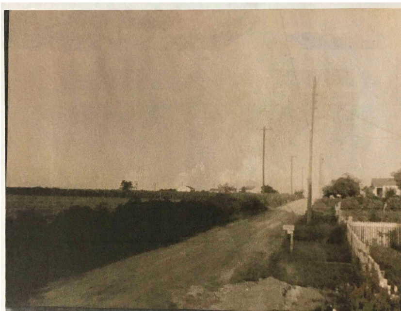
Photo 12. Looking east down Reinli Street toward Cameron Rd. October 1957.

Please send story suggestions: mwluecke@hotmail.com 512.536.0465